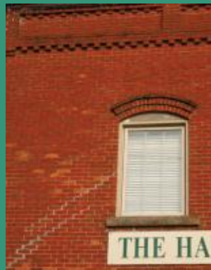
Photo 3, Pre-Rehab 2147 Hamilton Rd. City, State Front facade with cornice detail and mismatched mortar used in earlier repointing.

Label and number each photo and reference it in the application. In addition, key the picture to a floor plan with an arrow indicating the direction in which it was taken.