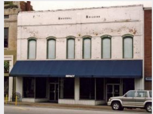
The photograph above shows the building described in the sample application prior to the rehabilitation work. Below left, the building is shown after its successful rehabilitation.